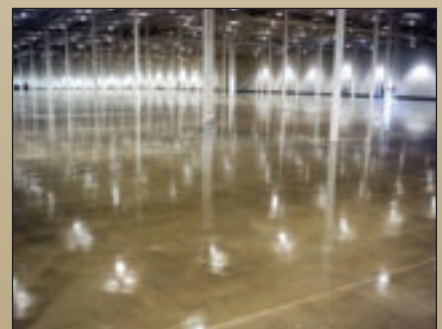
A smooth, strong surface made the Allstate printing and distribution center even more productive.

Step up the quality at your facility. Call 1-866-CONCARE today!