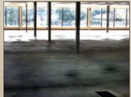
Inks and chemicals threatened to leach into the bare concrete.