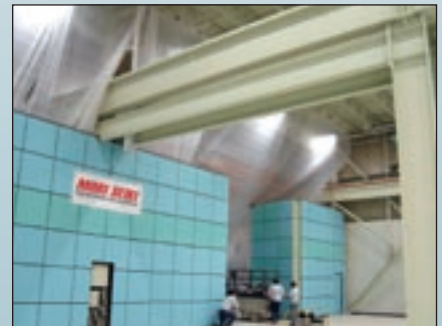
Concare crews protected perimeter windows and immovable machinery with floor-to-ceiling plastic.