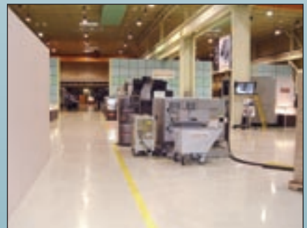
Concare's strong, attractive LevelRight EC-Q system was the perfect fit for Mori Seiki.

Make the right first impression! Check out Concare at www.concare.com .